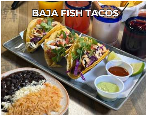
BAJA FISH TACOS