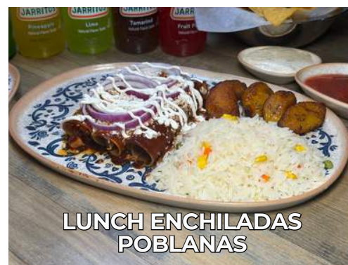
LUNCH ENCHILADAS POBLANAS