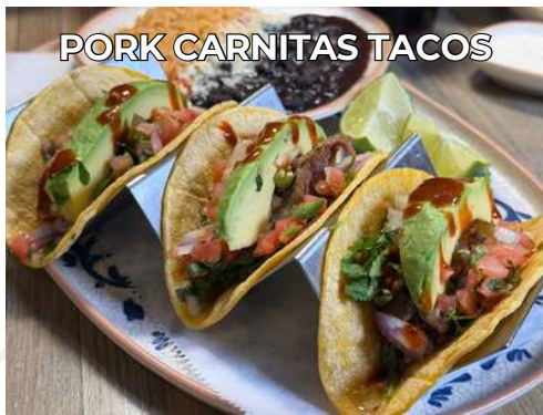
PORK CARNITAS TACOS