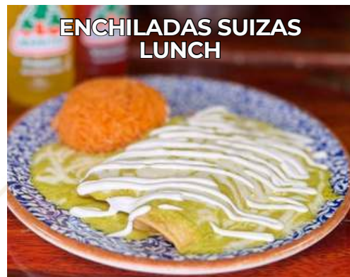
ENCHILADAS SUIZAS LUNCH