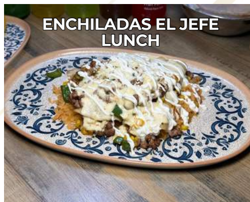
ENCHILADAS EL JEFE LUNCH