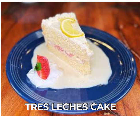
TRES LECHES CAKE