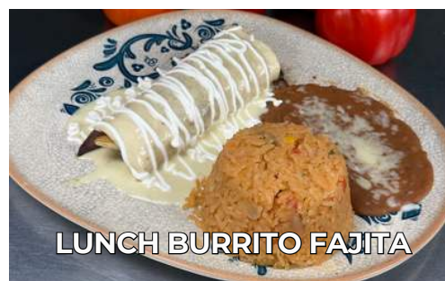
LUNCH BURRITO FAJITA