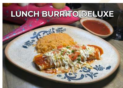
LUNCH BURRITO DELUXE