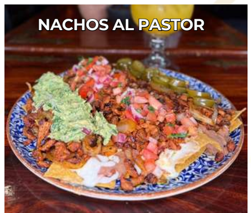
NACHOS AL PASTOR