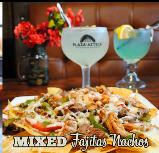
MIXED Fajitas Nachos