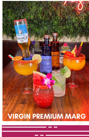
VIRGIN PREMIUM MARG