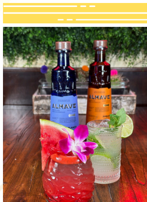
VIRGIN PREMIUM MARG