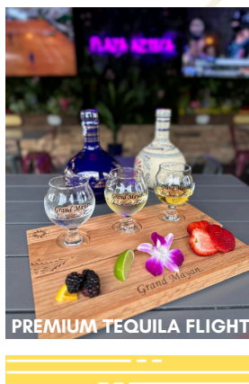
PREMIUM TEQUILA FLIGHT