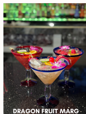
DRAGON FRUIT MARG