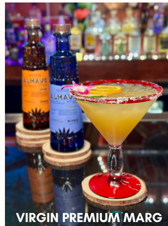
VIRGIN PREMIUM MARG