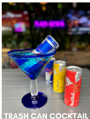
TRASH CAN COCKTAIL