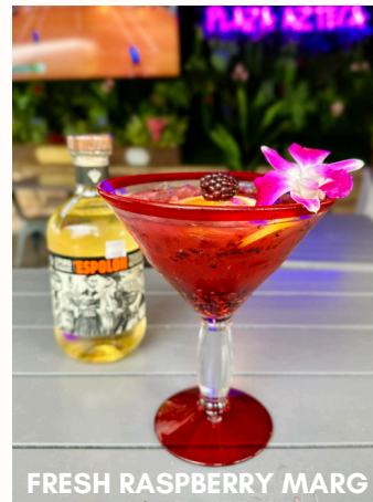
FRESH RASPBERRY MARG