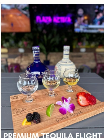
PREMIUM TEQUILA FLIGHT