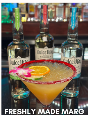
FRESHLY MADE MARG