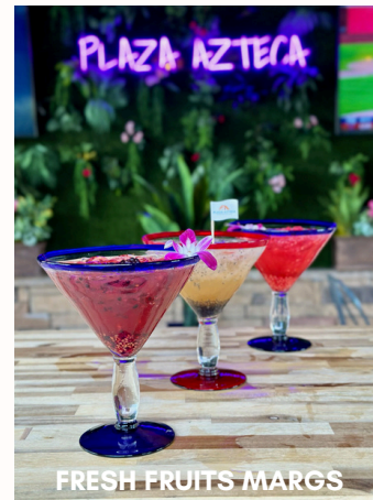
FRESH FRUITS MARGS