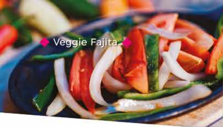
◆ Veggie Fajita ◆