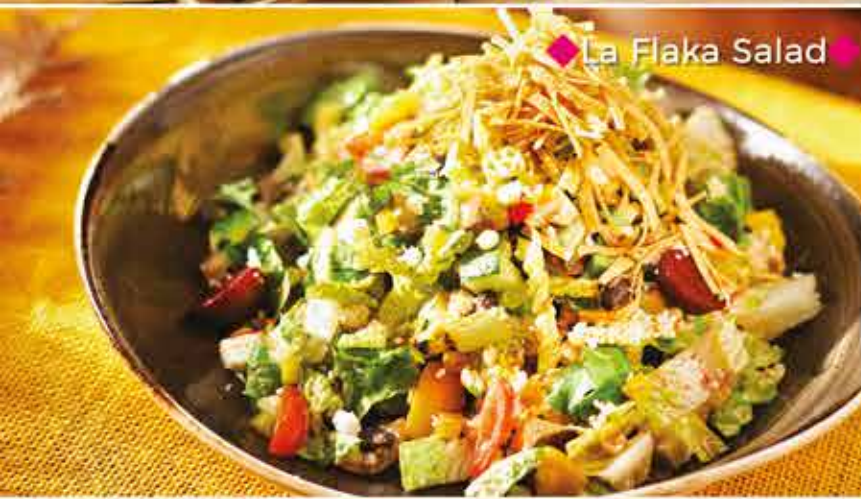
◆ La Flaka Salad ◆