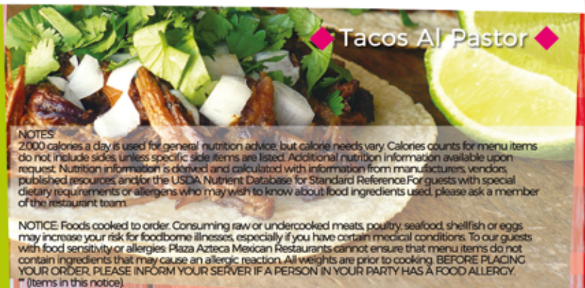
◆ Tacos Al Pastor ◆

NOTES 2000 calories a day is used for general nutrition advice, but calorie needs vary. Calorie counts for menu items do not include sides, unless specific side items are listed. Additional nutrition information available upon request. Nutrition information is derived and calculated with information from manufacturers, vendors, published resources, and/or the USDA Nutrient Database for Standard Reference. For guests with special dietary requirements or allergies who may wish to know about food ingredients used, please ask a member of the restaurant team.