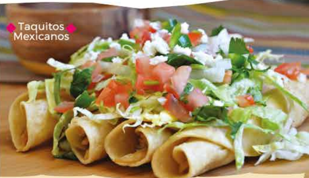
◆ Taquitos Mexicanos ◆

Shrimp Nachos 11.99 (1110 Cal) Grilled shrimp with sautéed onions and bell peppers.