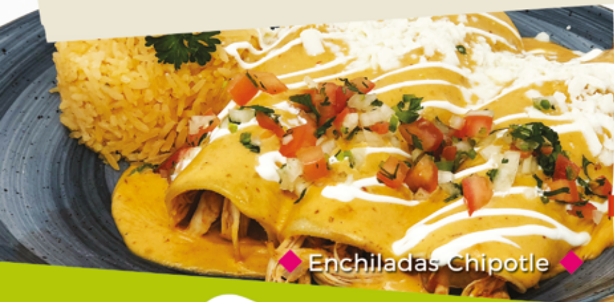
◆ Enchiladas Chipotle ◆

EL COMBO 11.50 (740 Cal) Two chicken enchiladas with lettuce, pico de gallo and sour cream, topped with queso fresco. Served with a side of rice and beans.