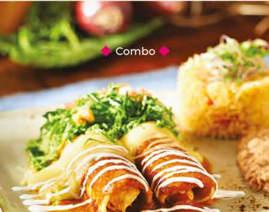
◆ Combo ◆