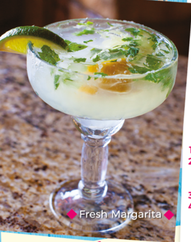
◆ Fresh Margarita ◆