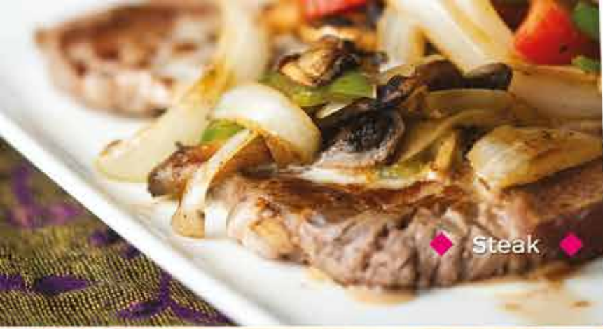
◆ Steak ◆