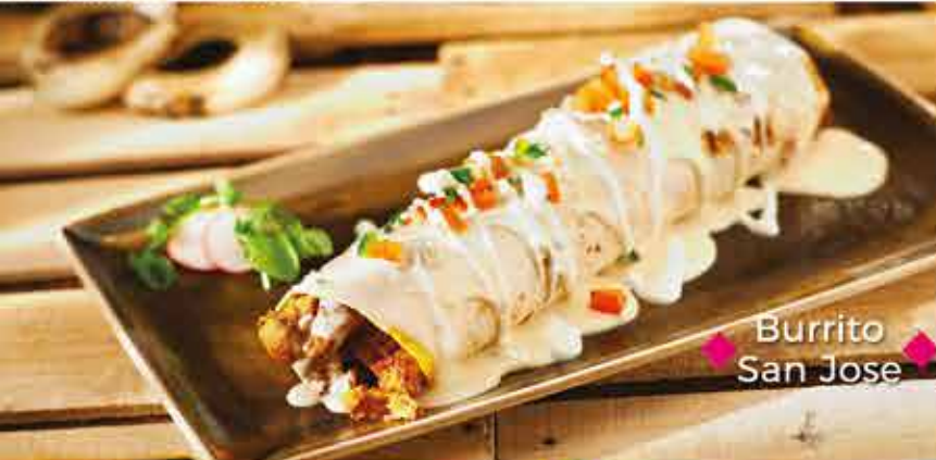
◆ Burrito San Jose ◆